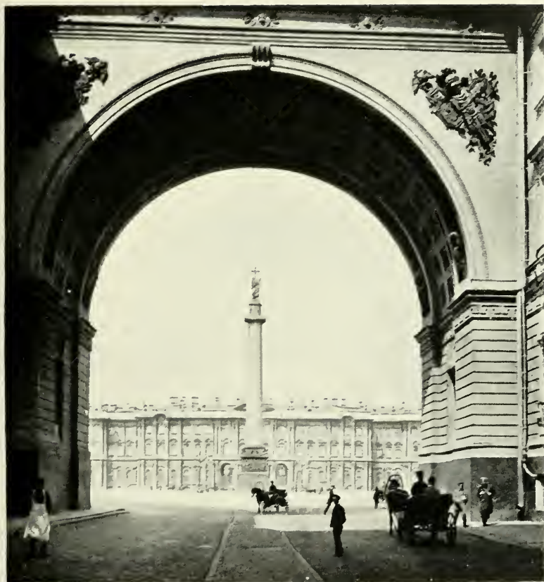
Alexander Column and the Czar's Winter Palace from the War Office Arch, St. Petersburg, Russia.