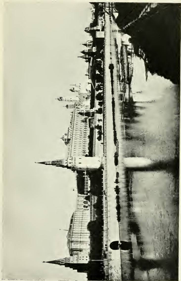
KREMLIN, MOSCOW, RUSSIA.